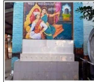
Hand wash Station from People