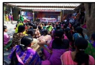
3 to 4 thousand people for annual function.