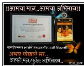
Making From Ex – Students