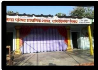
Stage for Student Activity.