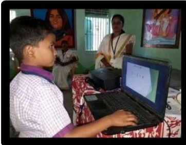
Use of Digital Education From 1 st standard.