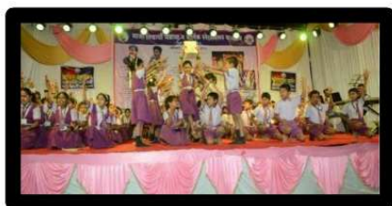
School all 127 students dance on School Chale hum on One Stage.