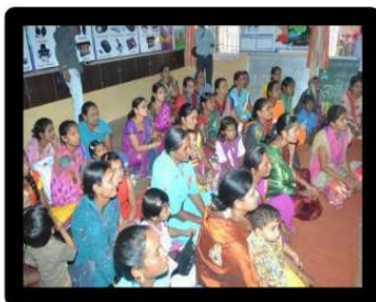
Mother Parents Meeting..