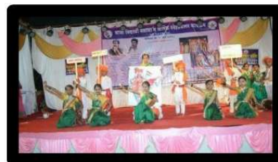
Student presentation Advanced Maharashtra! My Maharashtra!! Jay Maharashtra!!!