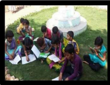
A.P.J.Abdul Kalam.Free Library